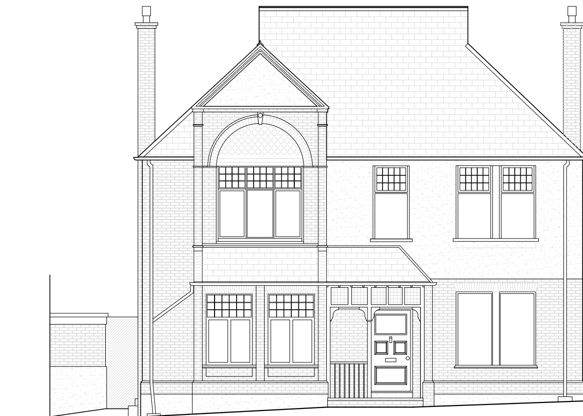
FRONT ELEVATION SCALE 1:100 0 1 2 3 4 5m