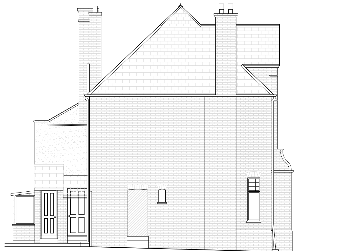
LEFT ELEVATION SCALE 1:100 0 1 2 3 4 5m